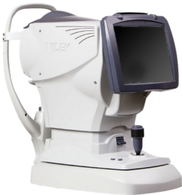
Nidek OPD-Scan III Wavefront Aberrometer